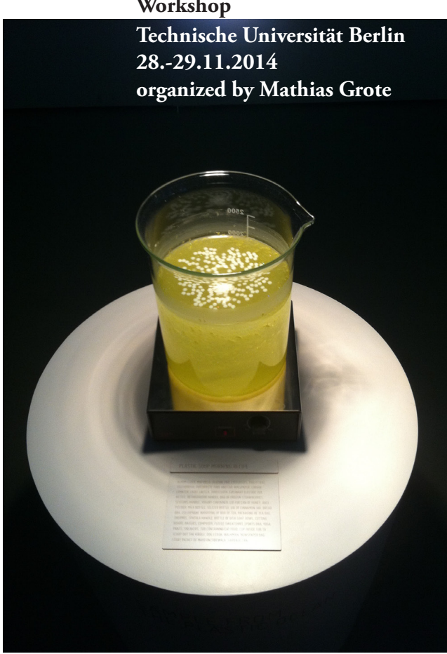
Pinar Yoldas: An Ecosystem of Excess, installation view Ernst Schering Foundation's Project Space, 2014